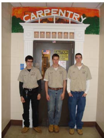
The Carpentry Façade before the paint job...