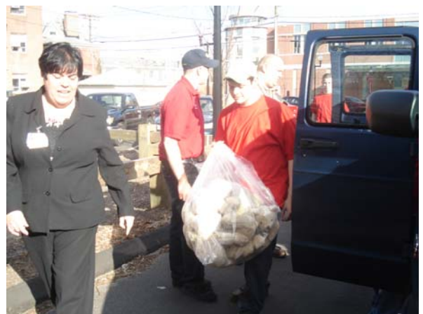
Community Service always leaves students with a great feeling!