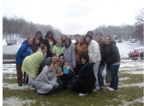
2008 Vinal Tech Plunging Pirates were winners of the coveted Rockin' Schoolhouse Award for the CT Special Olympics Penguin Plunge