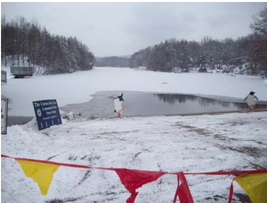
The icy waters of Crystal Lake for the CT Special Olympics Penguin Plunge