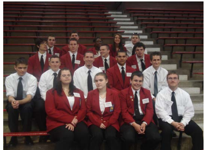
Vinal Tech SkillsUSA State Champions Kansas City bound!