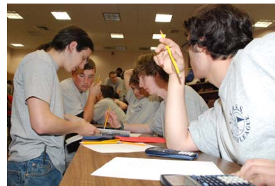
Vinal Tech Math League busy at work at the 8 th Annual Math League competition at Norwich Tech