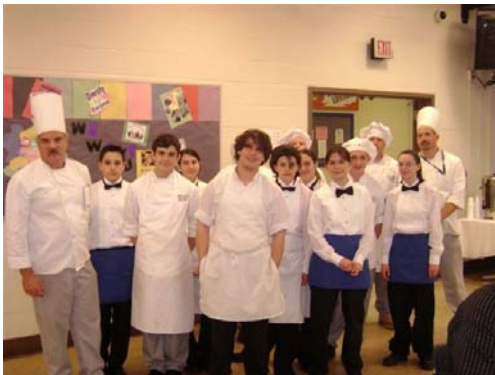
Culinary students who worked hard on the TTAC Committee dinner held on May 6, 2008