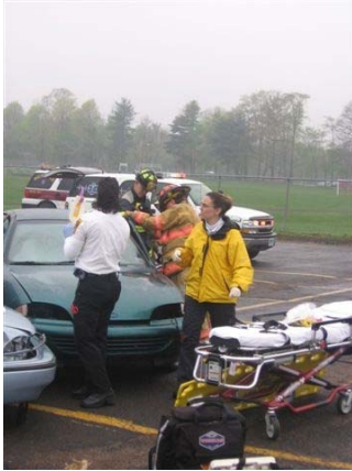
Mock car crash presentation May 2, 2008